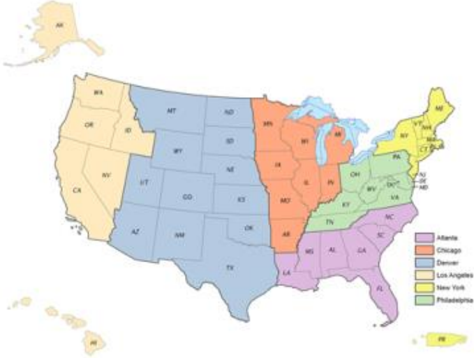
List of States Serviced by Each Regional Office