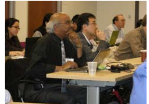
The audience listens intently to the speaker.