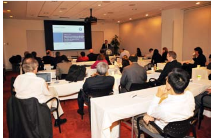
The audience listens attentively to the speaker at the NISS and OCC Explorations Workshop which was held in Washington DC in October.