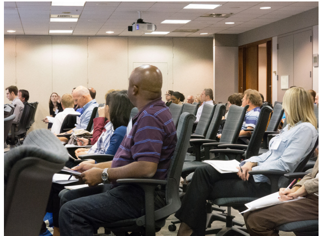
Attendees enjoying informative talks at the ITSEW 2014.

Approximately 70 people attended the event. All of the presentations are available at the NISS website .