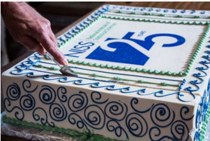
Cutting the cake.