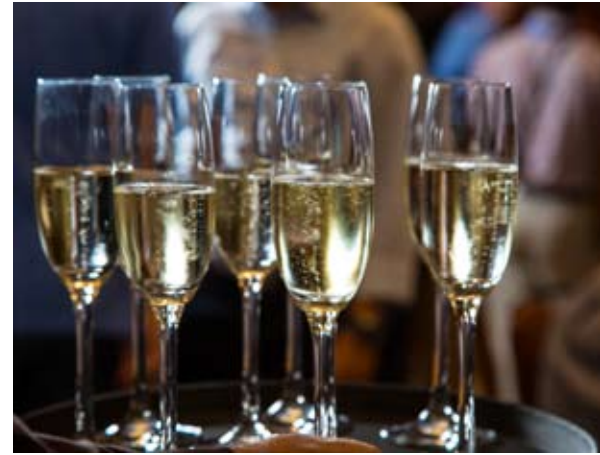
Getting ready for a champagne toast.