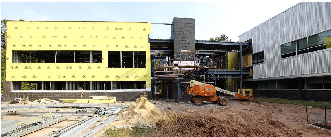
The building addition as of June 25, 2008